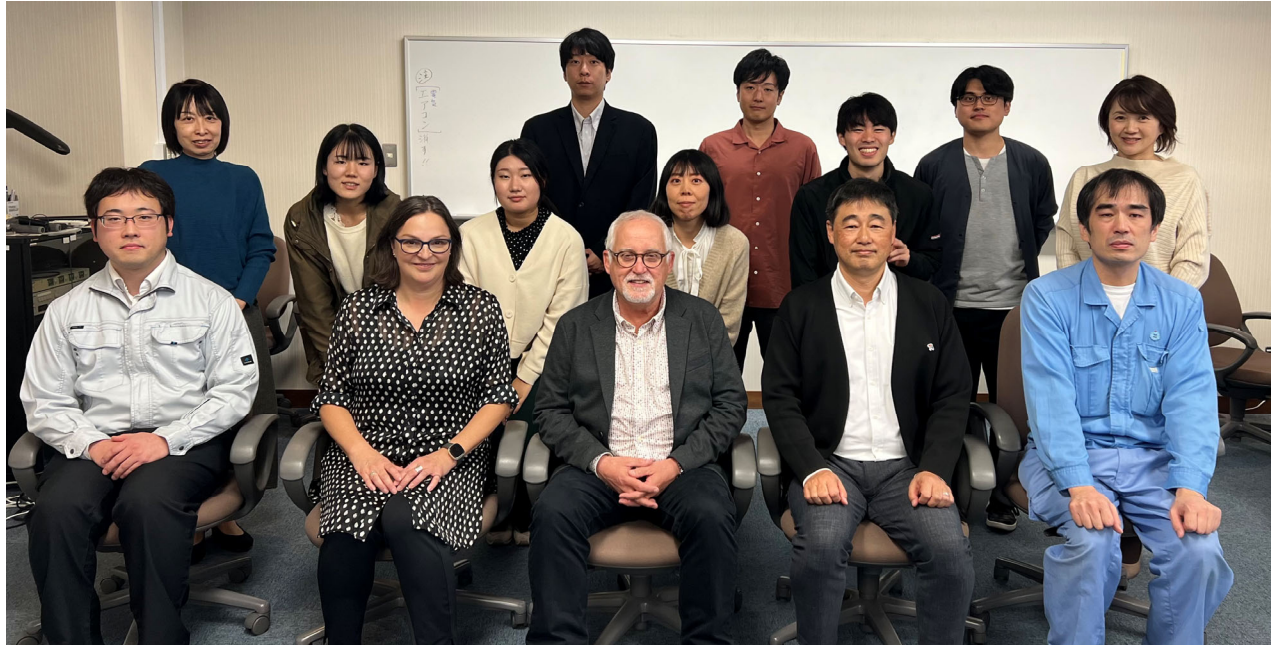
Welcome Lunch November 10th, 2023